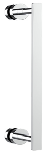
Large Rosette (Large 1 1/2")